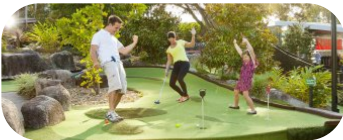
Victoria Park Golf Course including Mini Golf