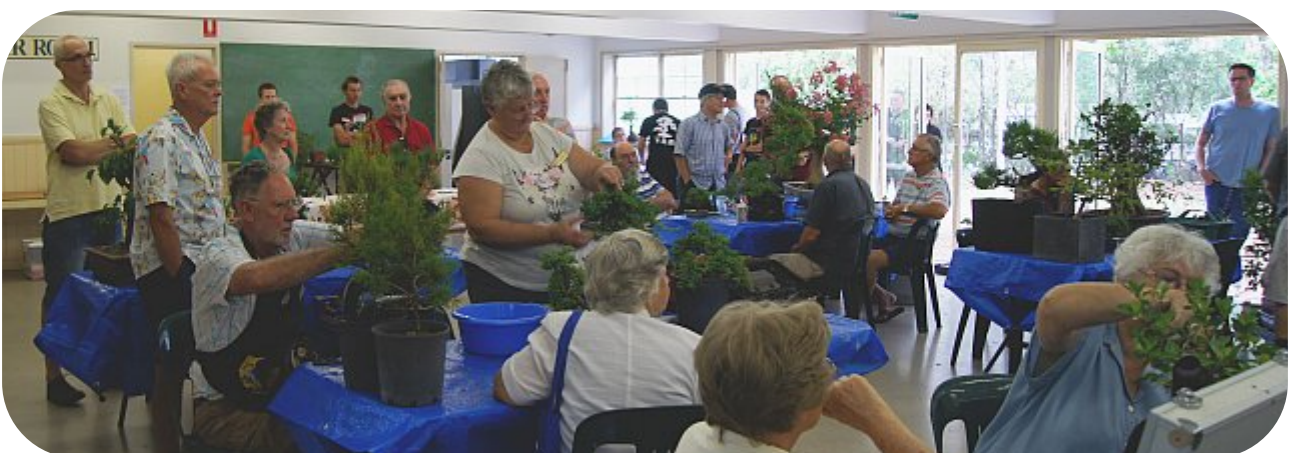
A typical workshop crowd at BSQ

From humble beginnings in 1973 with only a handful of founding members, the Bonsai Society of Queensland enjoys consistent success as one of Australia's larger clubs with steady membership well over 100 and 50+ members to our monthly meetings. We provide bonsai knowledge in a relaxed atmosphere where bonsai artists of all levels of experience can learn from each other. Whatever we learn is ours to share with others as we develop bonsai for the pleasure of the present and the benefit of the future.