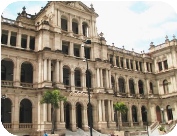
Conrad Treasury Casino

Within close proximity to Brisbane if you choose to stay on is the Gold Coast, the Sunshine Coast, Mt Tamborine, Lamington National Park, Moreton and Stradbroke Islands... the list goes on and on. Then of course there are the social activities of the Convention functions. Come and join us and have some fun.