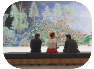
Queensland Art Gallery